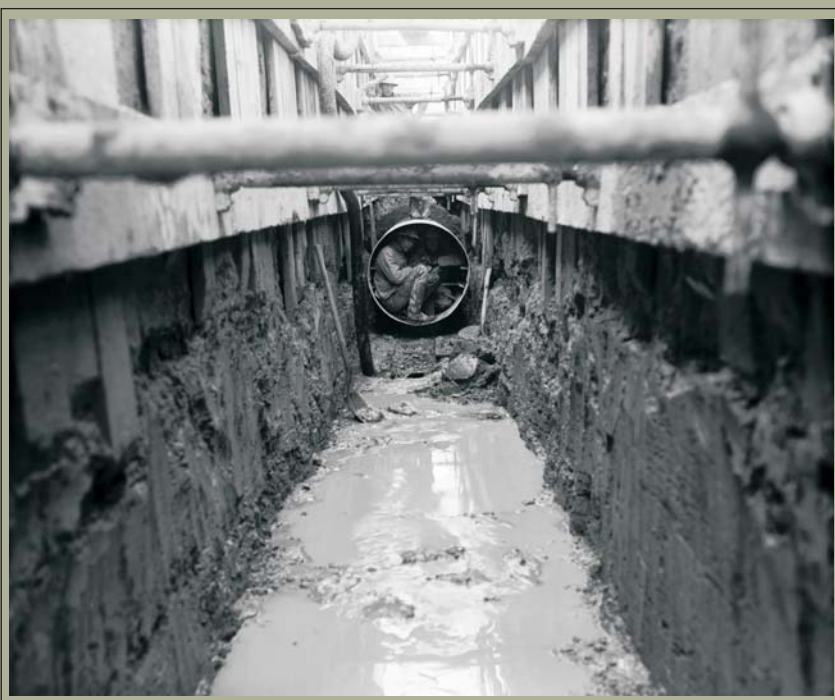
Concrete sewer construction