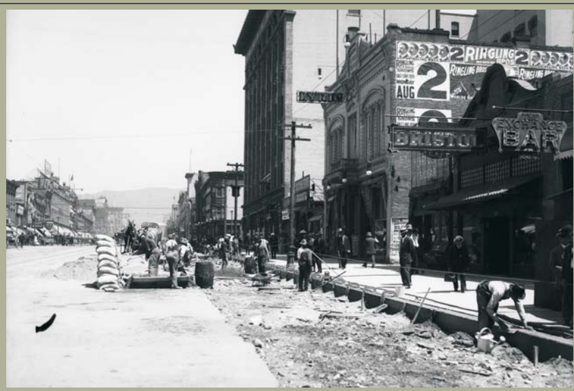
Paving main street