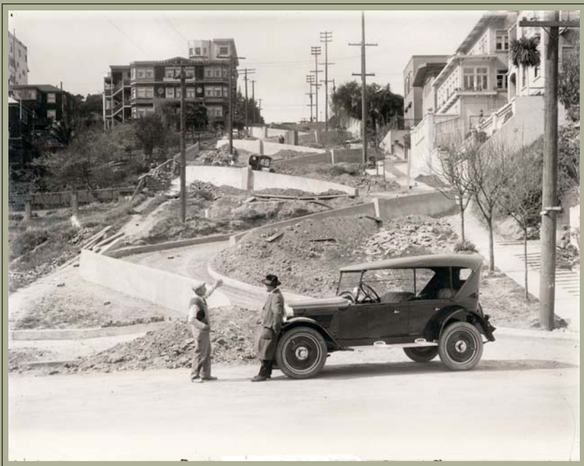
Road construction, San Francisco