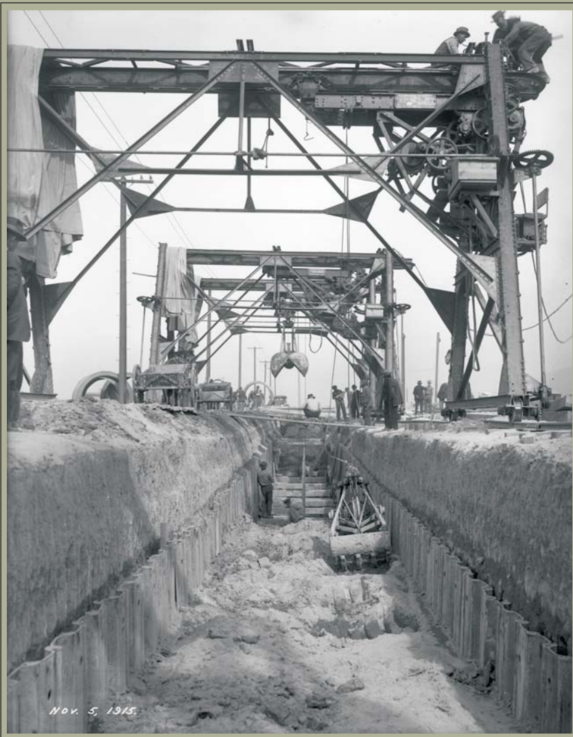
Sewer excavation machine, 1915